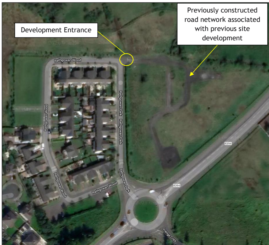
Figure 3: Rathgowan Park, Development Access and Pre-existing Road Extents