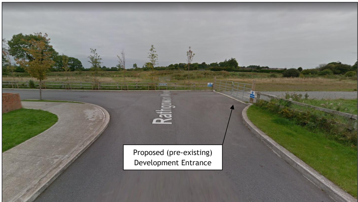
Figure 2: Rathgowan Park entry road (facing due north)

The management of construction traffic on the public road network around the development will be a critical part of the overall project and must be actively managed by the Contractor.